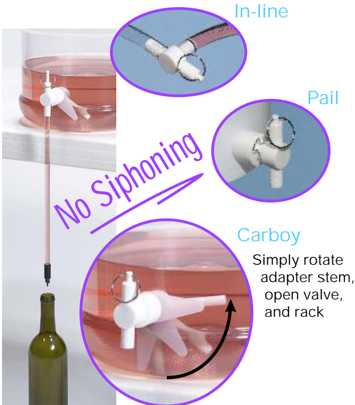
Rack & Fill